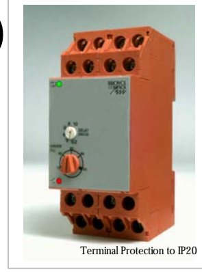
Dims: to DIN 43880 W. 35mm